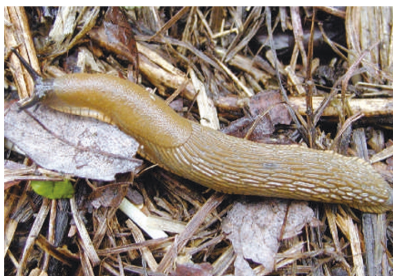
Figure 1 | Arion lusitanicus — conservation agent.

grassland sown with rye grass ( Lolium perenne ) and white clover ( Trifolium repens ) on a former arable field that contained its own residual seed bank of weed and other plant species.